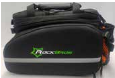
LARGE TRUNK BAG

All of our bikes come with a safety garment, helmet and have a bell, bike stand, rear carrier with a trunk bag where you can carry your personal gear whilst on the trail. In the carrier bag you will find a tyre pump, a small toolkit, puncture repair kit and a bike lock. All of our bike seats are the very latest unisex design and made from memory foam which is more comfortable than a gel seat.