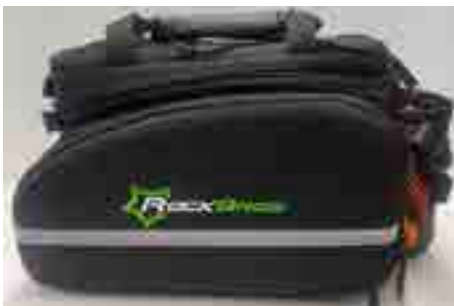
LARGE TRUNK BAG

All of our bikes come with a safety garment, helmet and have a bell, bike stand, rear carrier with a trunk bag where you can carry your personal gear whilst on the trail. In the carrier bag you will find a tyre pump, a small toolkit, puncture repair kit and a bike lock. All of our bike seats are the very latest unisex design and made from memory foam which is more comfortable than a gel seat.