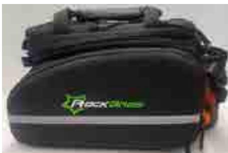
LARGE TRUNK BAG

All of our bikes come with a safety garment, helmet and have a bell, bike stand, rear carrier with a trunk bag where you can carry your personal gear whilst on the trail. In the carrier bag you will find a tyre pump, a small toolkit, puncture repair kit and a bike lock. All of our bike seats are the very latest unisex design and made from memory foam which is more comfortable than a gel seat.