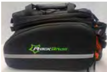
LARGE TRUNK BAG

All of our bikes come with a safety garment, helmet and have a bell, bike stand, rear carrier with a trunk bag where you can carry your personal gear whilst on the trail. In the carrier bag you will find a tyre pump, a small toolkit, puncture repair kit and a bike lock. All of our bike seats are the very latest unisex design and made from memory foam which is more comfortable than a gel seat.