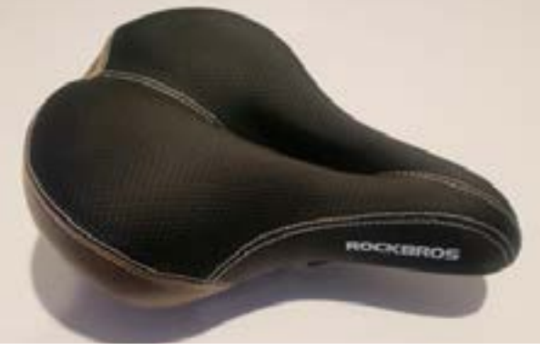
COMFORT SEAT New unisex maximum comfort memory foam seat.