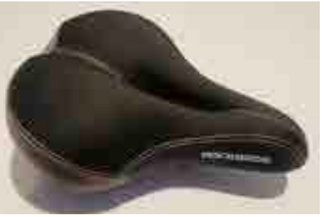
COMFORT SEAT New unisex maximum comfort memory foam seat.