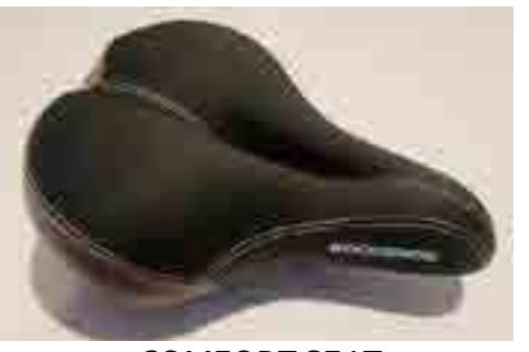
COMFORT SEAT New unisex maximum comfort memory foam seat.