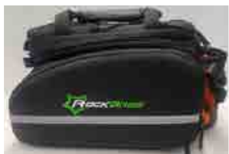
LARGE TRUNK BAG This deluxe bag is a large trunk bag which includes an expanding top section, large roll-out side panniers. Large 18 litre capacity.

All of our bikes come with a safety garment, helmet and have a bell, bike stand, rear carrier with a trunk bag where you can carry your personal gear whilst on the trail. In the carrier bag you will find a tyre pump, a small toolkit, puncture repair kit and a bike lock. All of our bike seats are the very latest unisex design and made from memory foam which is more comfortable than a gel seat.